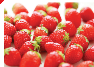
Predecessor Canon Product without V 2 Color Technology