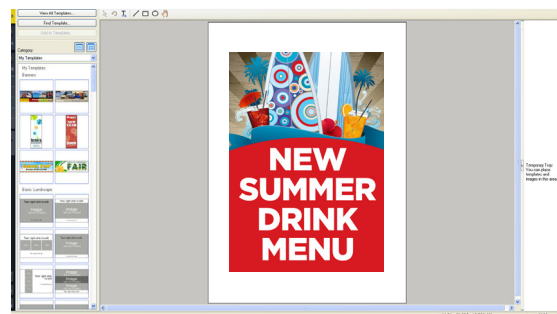
PosterArtist poster creation software