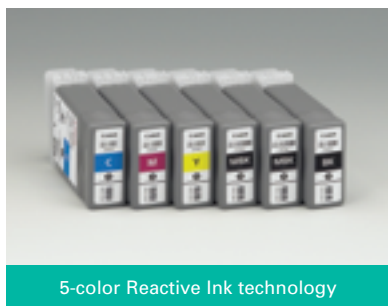
5-color Reactive Ink technology