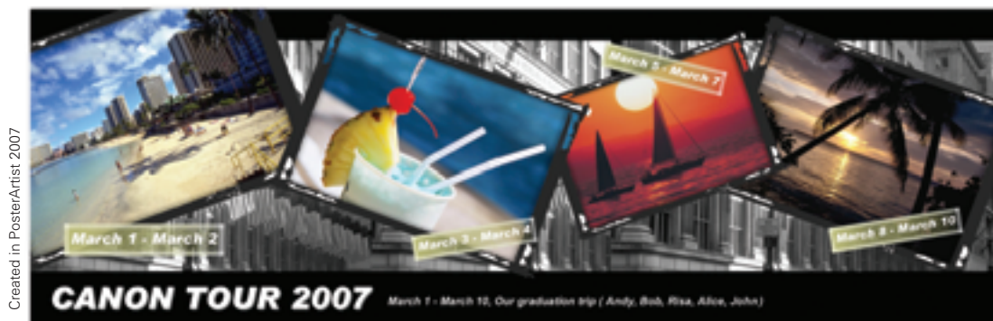
Created in PosterArtist 2007

Fast and accurate printing of Computer-Aided Design (CAD) drawings, architectural elevations, Geographic Information Systems (GIS) maps, marketing planograms, and other intricate documents requiring fine sharp lines, smooth curves, crisp text, fade/scratch resistance, and incomparable detail.