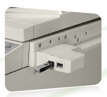
Optional USB hub

USB Support. The systems also go beyond traditional printers by supporting USB devices, such as memory media, keyboards, and authentication card readers. Each system includes one port as , or you can connect up to three devices with an optional USB hub.