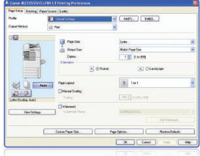
Driver user interface

The Canon imageRUNNER 2530/2525/2520 models can output crisp documents with true up to 1200-dpi accuracy. Each system includes support for Canon's innovative UFR II LT print technology with optional PCL 5e/6 and PostScript® 3™ emulation on Windows® and Macintosh® workstations. The intuitive print driver is so smart that it can recognize the capabilities of each system and provide users with only the available options. The Series also supports printing from Citrix® and SAP® business environments.*